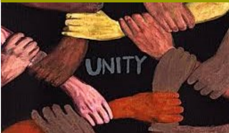
St. Angela Merici- 1548 Blue Hill Ave.- Mattapan

Sur les pas de celui qui est lumière des nations faisons route avec Jésus à travers nos pèlerinages pour l'année 2019